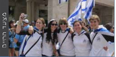
MARCH OF THE LIVING